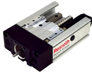
Rexroth CKK and CKR Compact modules are frequently used in applications requiring side-mounted loads.

LOSTPED is an acronym that stands for L oad, O rientation, S peed, T ravel, P recision, E nvironment and D uty cycle. Each letter represents one factor that must be considered when sizing and selecting a linear motion system. Each factor must be considered individually as well as in conjunction with the others to ensure the best overall system performance. For example, the load imposes different demands on the bearing system during acceleration and deceleration than during constant speed movements. As more linear motion