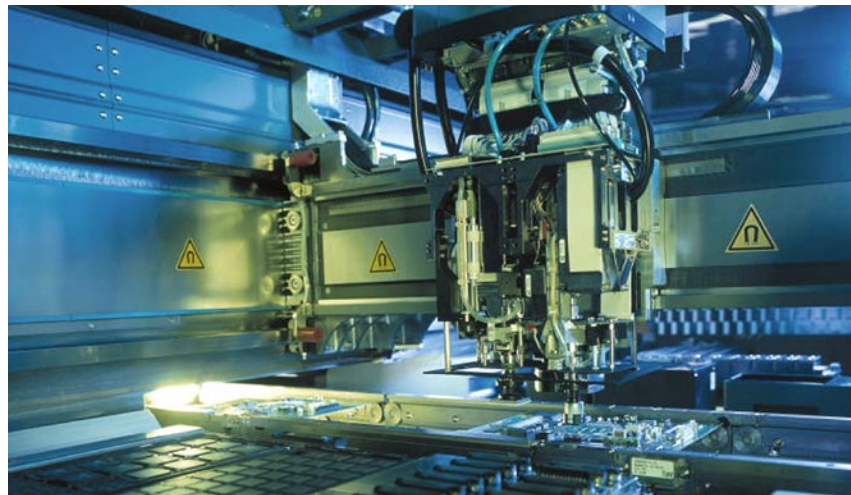
Speed and acceleration also affect the selection of a linear motion system.

Below are descriptions of each LOSTPED factor, as well as key