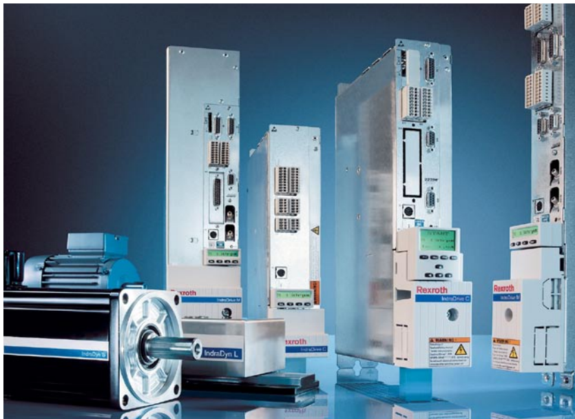
Rexroth IndraDrive with Safe Motion™ technology.

Tube and Profile Bending Machines Incorporate Intelligent Safety System from Bosch Rexroth. More and more tubes and profiles are being used in automotive production. They offer advantages in terms of weight, rigidity,