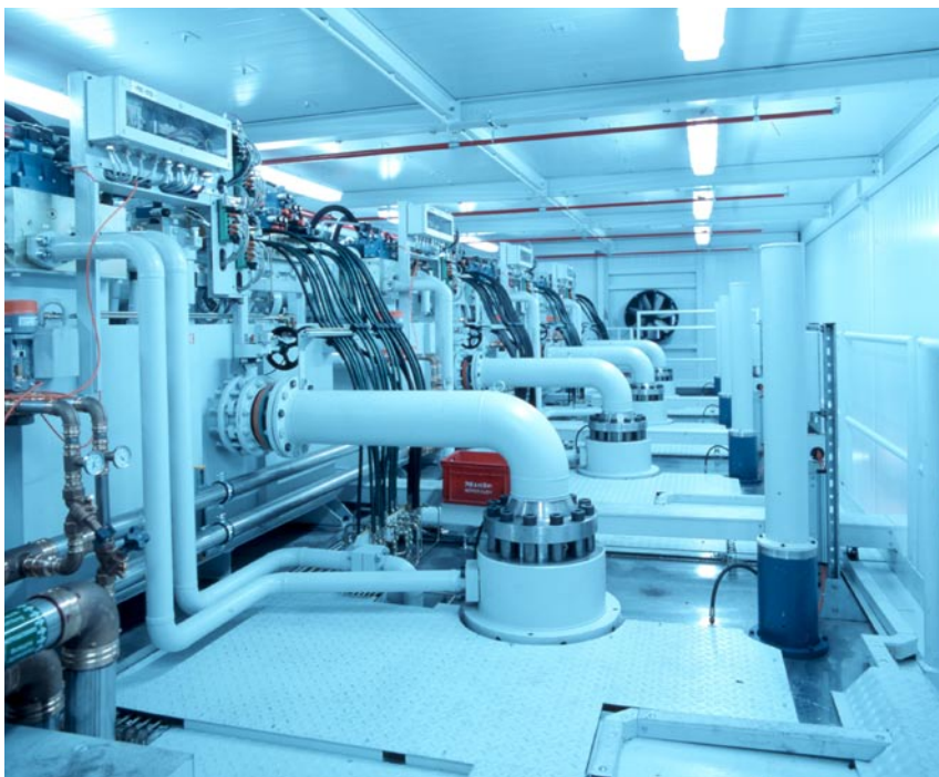
The hydraulic power unit installed in a press sound encapsulator.

The auxiliary axes are controlled by a separate Rexroth IH20 control block, which consists of 17 individual segments joined to each other via tie rods. Each segment controls an axis. The IH20 kit system enables very compact construction, with the ability to