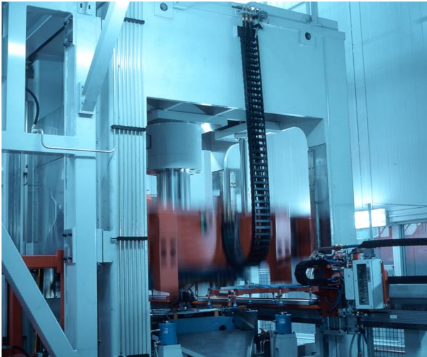
The 630 ton Laple press with Rexroth hydraulics.

Bosch Rexroth provided the hydraulic system on a new press line for Miele, a manufacturer of automatic washers and dryers, helping them integrate an existing press with five new presses to improve their manufacturing process for coated appliance panels.